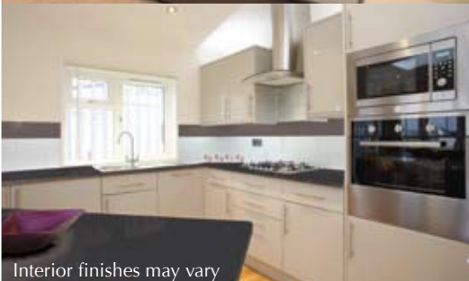
Interior finishes may vary